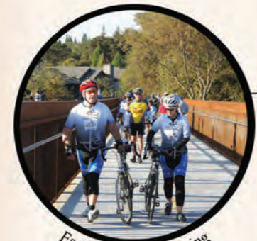
East Bidwell Overcrossing

*Bike lane in south-west bound direction only between Natoma Station Drive and Blue Ravine Road.