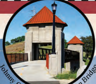
Johnny Cash Trail Bike/Pedestrian Bridge