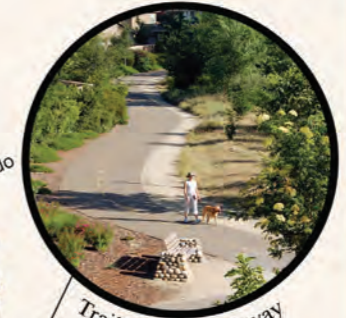
Trails in The Parkway