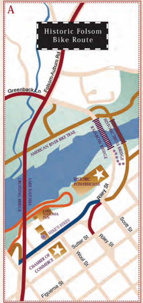
Historic Folsom Bike Route