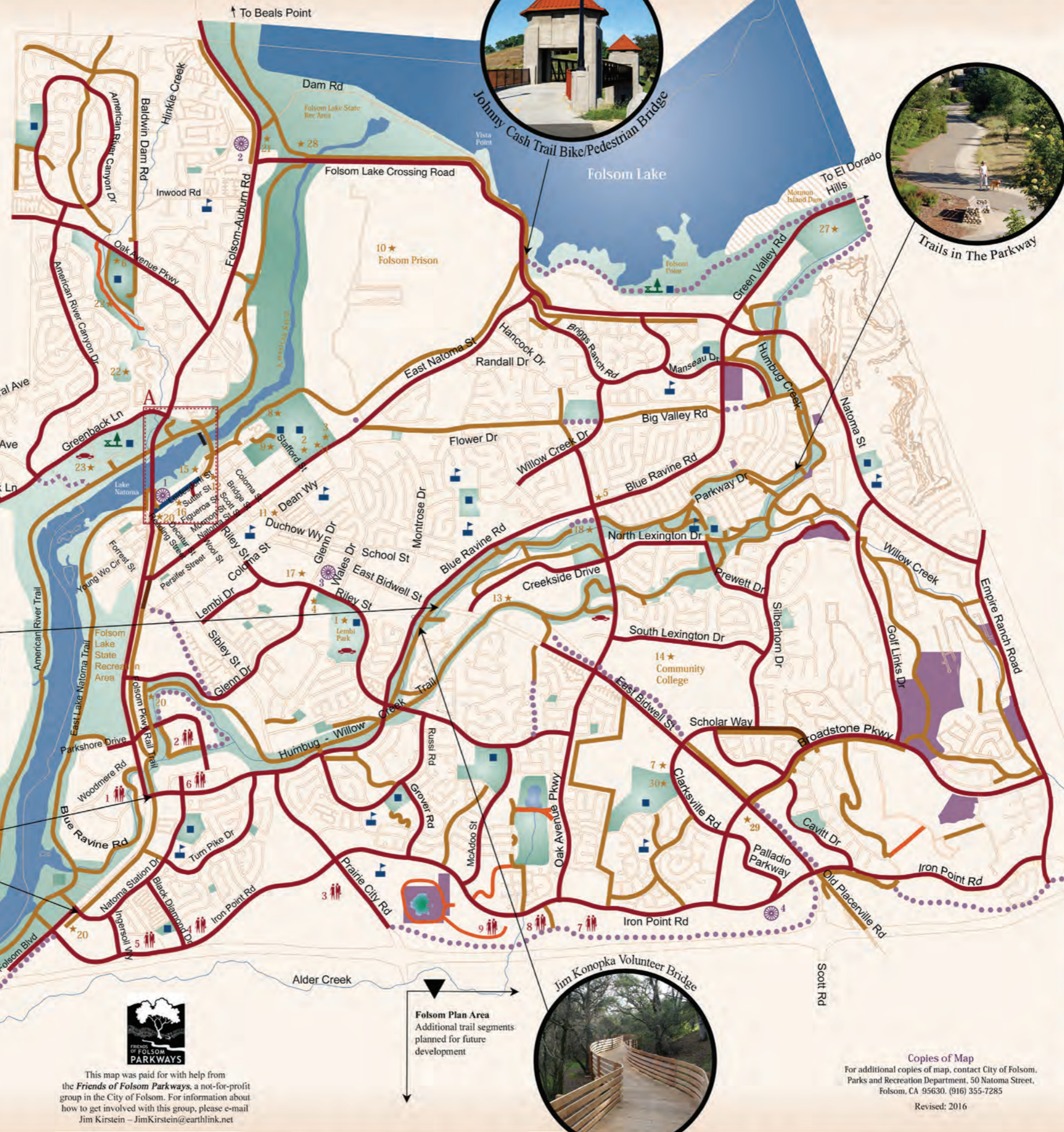
To Hazel Ave